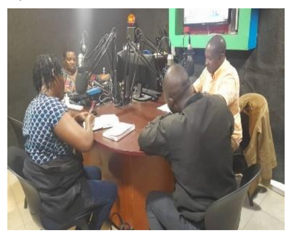
Radio talk shows on Voice of Kigezi(V.O.K)

and topowa forums, Community Barazas at parish level and also to raise awareness among the public on issues regarding electoral processes and as the feedback mechanism where different stakeholders were identified as panelists to handle key topics.