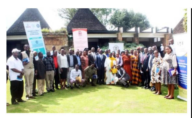
Regional Dialogue on 2026 General elections and Peaceful transition

Through SCENE activities implemented during 2024 various results were achieved that included: