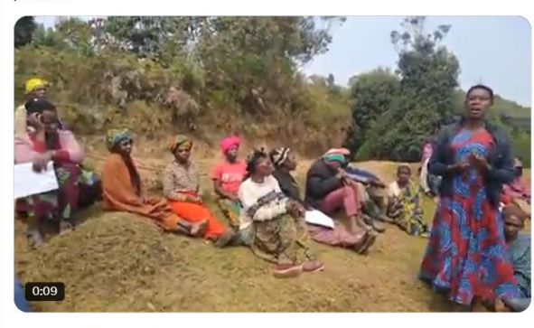
5:07 PM · Aug 23, 2024 · 97 Views

KICK corruption out of Uganda (KICK-U) in partnership with Uganda NGO forum scaled and and deepened the SCENE project that aims at engaging citizenry in electoral process. This has created platform form for the Batwa community to express their concerns regarding electoral