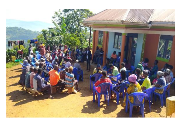
Baraza in Bukoora parish - Kitumba subcounty -Kabale District

Therefore, SECNE activities created platforms for citizenry to raise their views regarding political and democratic issues and other keys issues affecting political and service delivery in communities.